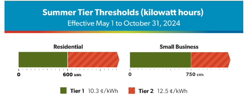
Prices remain unchanged. Prices apply to the Electricity Line of your bill